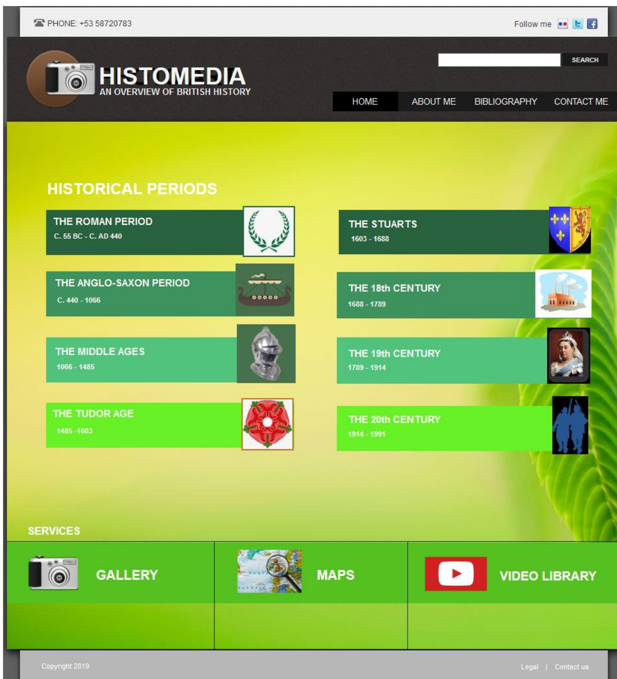
Fig. 1. Home Page of the HistoMedia

provides a section up to the right, where users may search for specific information, and a section for bibliography to consult and web links. (See fig. 1).